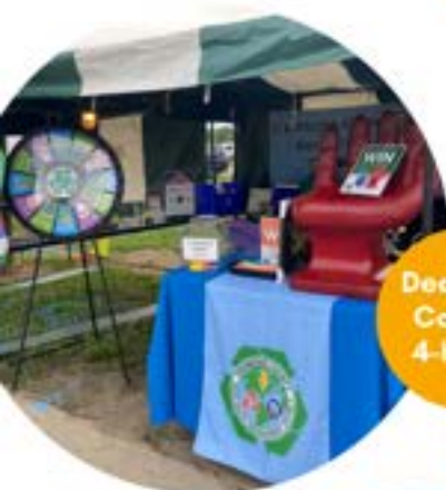
Dearborn County 4-H Fair

The DCRC partnered with the North Dearborn Library in April for a Community Shred Day. Student volunteers from Harrison Middle School Junior Honor Society helped remove items from the cars. The DCRC also donated items for a bird feeder craft that was done inside the library.