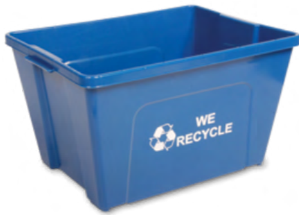
18 gallon bin $8.00