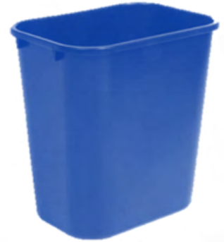
28 quart bin $5.00