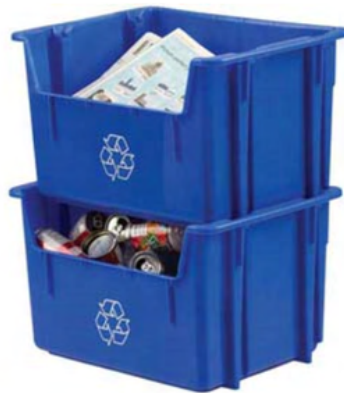
Multi Recycler 12 gallon bins $13.00 each